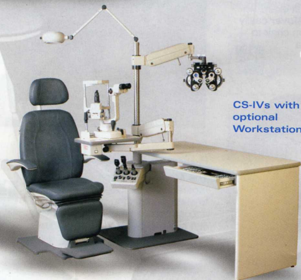
CS-IVs with optional Workstation